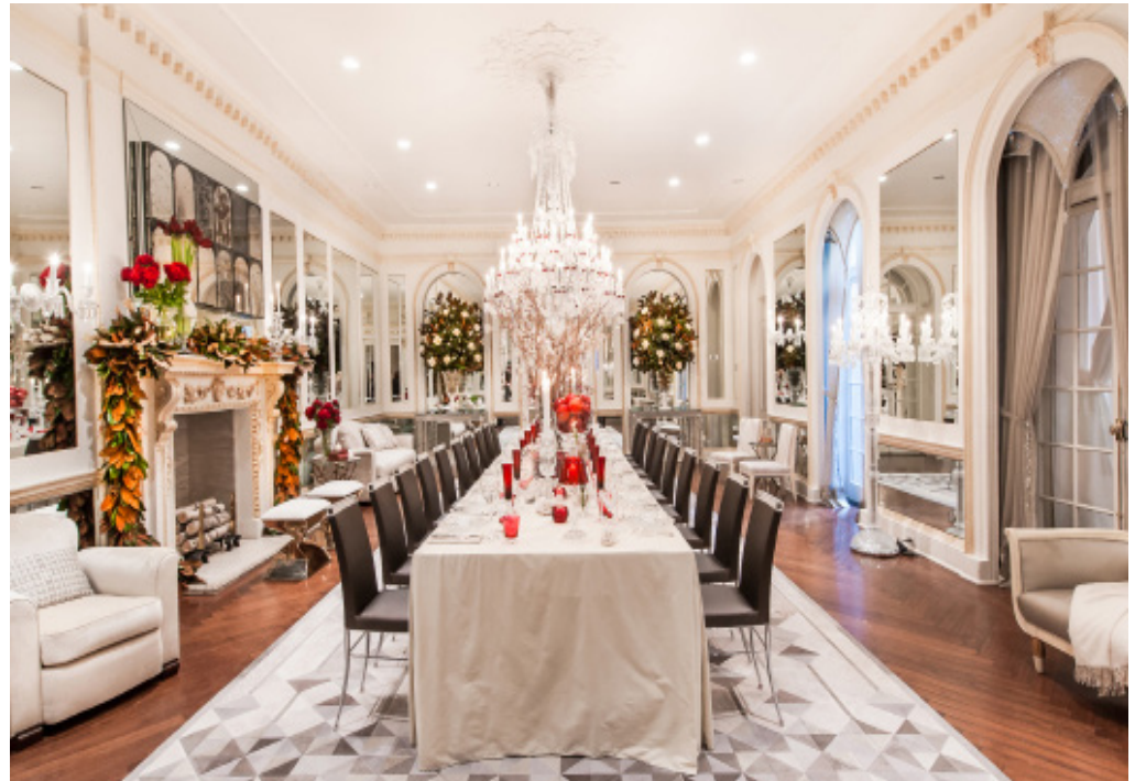
Amy Lau Design