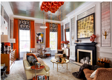
Cullman & Kravis, Inc.