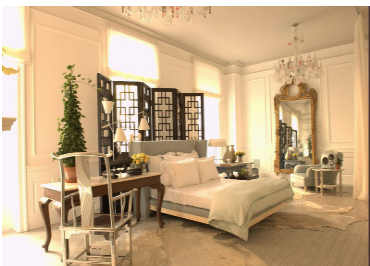
Vicente Wolf Associates, Inc.